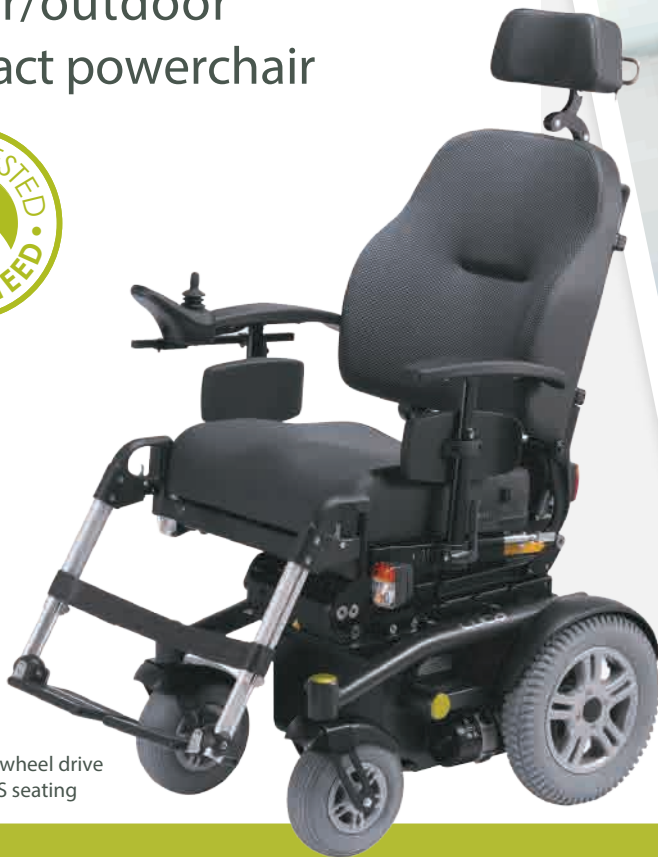
LUCA rear-wheel drive with QCLASS seating